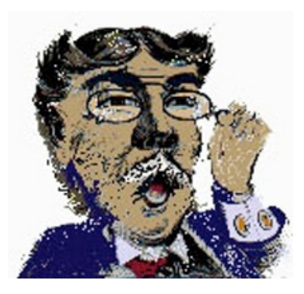
Exhibit 07 08.11 Graphic Novels